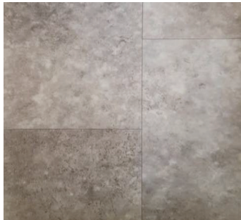
91141 Olive Bluff