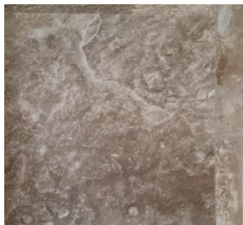
91180 Desert Cream