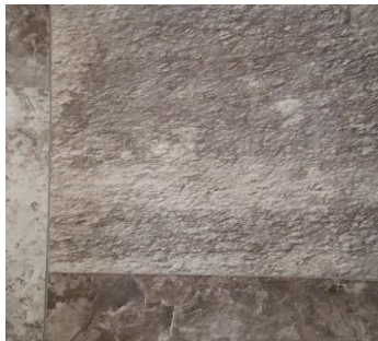
91182 Deep Taupe