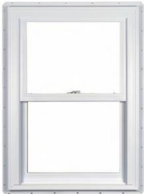
2900 Series STD With No Grids and With Low-E Smart Sun Tech.